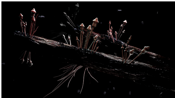
Sequence A (frame no. 2063), 2007

One of a series of nine unique digitally constructed images, c-print 44 x 74 inches