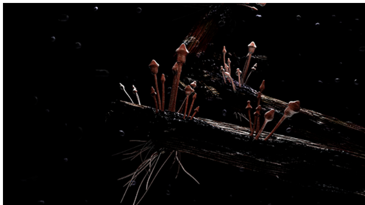
Sequence A (frame no. 2517), 2007

One of a series of nine unique digitally constructed images, c-print 44 x 74 inches