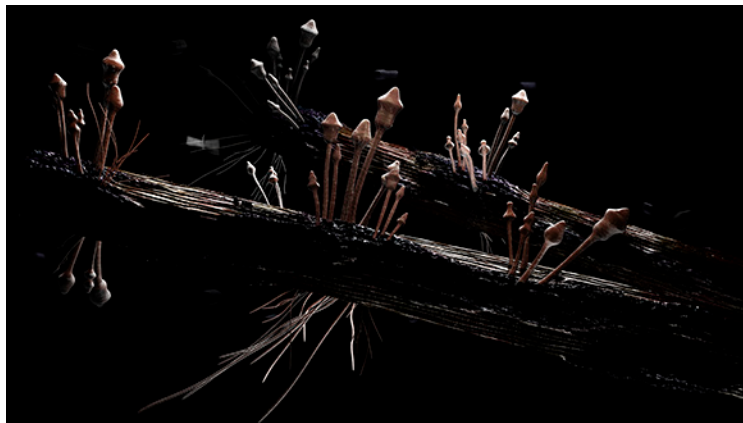
Sequence A (frame no. 1770), 2007

One of a series of nine unique digitally constructed images, c-print 44 x 74 inches