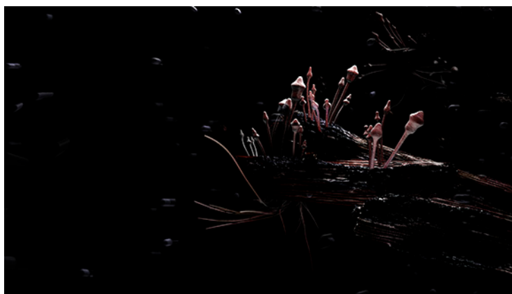
Sequence A (frame no. 2735), 2007

One of a series of nine unique digitally constructed images, c-print 44 x 74 inches