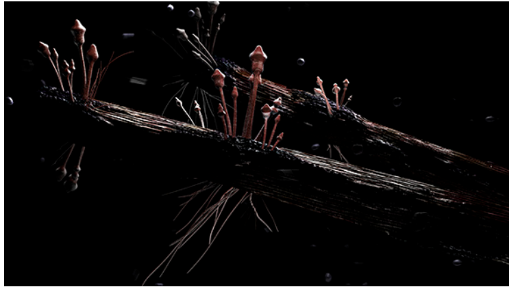
Sequence A (frame no. 0747), 2007

One of a series of nine unique digitally constructed images, c-print 44 x 74 inches